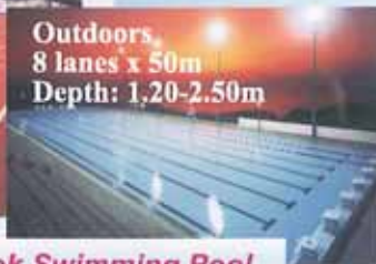
Henry Fok Swimming Pool

Outdoors, 8 lanes x 50m Depth: 1.20-2.50m