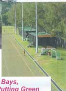
Golf Driving Bays, Sand Bunker and Putting Green