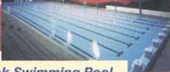
Henry Fok Swimming Pool

Outdoors, 8 lanes x 50m Depth: 1.20-2.50m