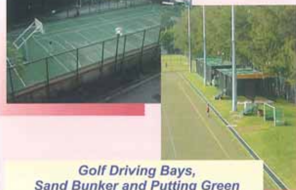
Golf Driving Bays, Sand Bunker and Putting Green